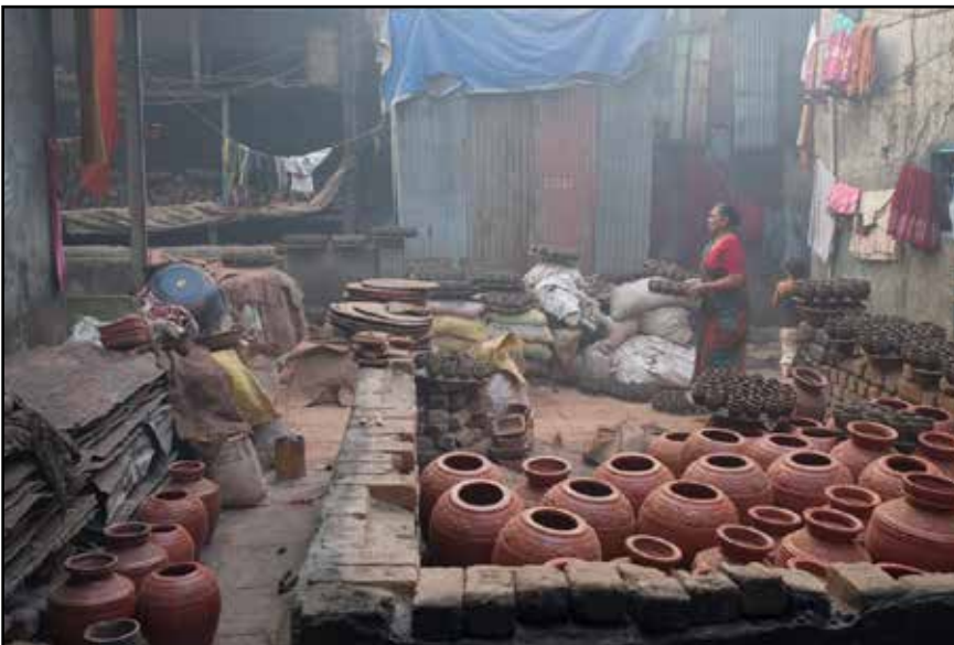
Figure 4: Pottery unit in Dharavi, Mumbai

Further pull factors include clusters of similar businesses which act as a magnet for employees, such as leather goods in Dharavi, Mumbai. Public services are easier to fund in densely populated areas. Cities therefore have better health and education outcomes which tend to increase productivity and incomes. These advantages attract more migrants. Cities fund art and culture, have an openness to science and education and display the toleration required to benefit from ethnic diversity. Creative people are attracted to cities and are associated with economic dynamism.