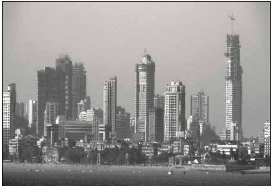
Figure 3: Mumbai skyline from Nariman point

Greater Mumbai had a population of 12,478,477 in 2011 (Government of India Census). This was 4.7% larger than in 2001, when the Census recorded a population of 11,914,398. Greater Mumbai occupies 438 km 2 yet the metropolitan area is almost ten times bigger at 4,355 km 2 . The area includes outlying townships that are million cities on their own account. It is estimated that the total population of Mumbai, including the metropolitan area is 20.5m. According to the International