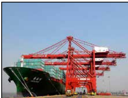
Figure 6: Jawaharlal Nehru Trust Port